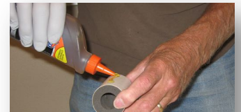
Fig 2 Apply glue to the grain