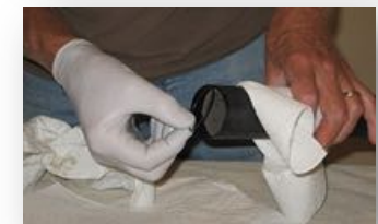
Fig 4 Insert grain spacer O-ring