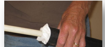
Fig 1 Wipe any dust from inside of the liner